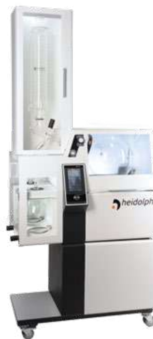
Max. evaporator flask size: 20 L

Maximum performance with systems that perfectly complement each other. Discover the Hei-CHILL models 3,000 and 5,000 W.