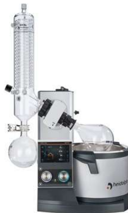
Max. evaporator flask size: 5 L

The perfect add on available with cooling capacities of 250, 350, 600 or 1,200 W.